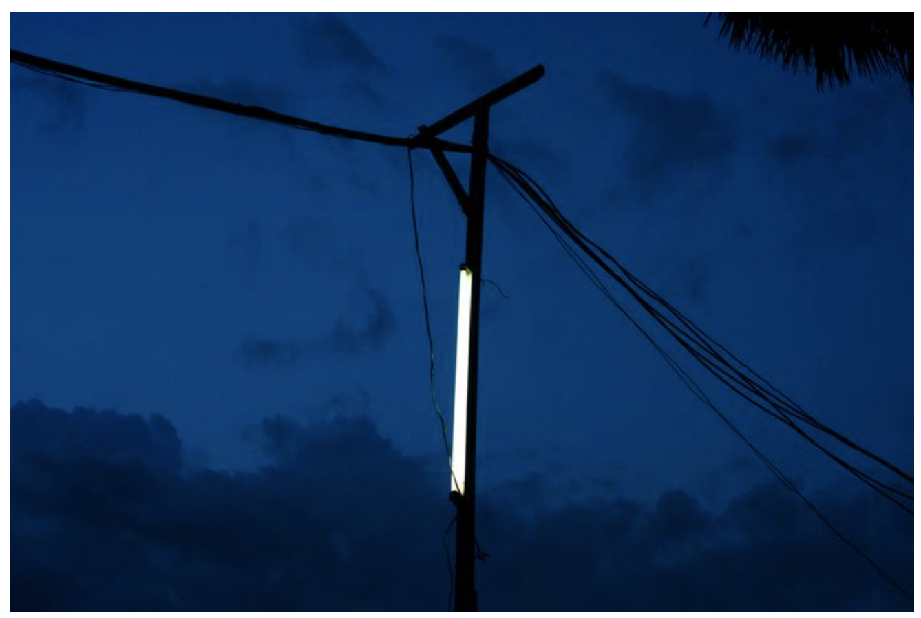
This is further explored in his other two collections from Thailand: BackStreets and PlantLife . The former gives viewers a chance to see Bangkok without the swarm of people, and the latter